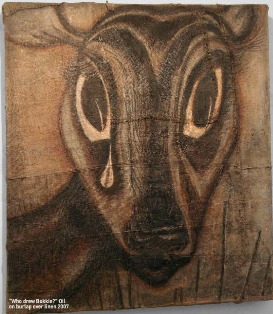
"Who drew Bokkie?" Oil on burlap over linen 2007

Subversion of loaded South African imagery and cultural signage underpins Koorlands work.