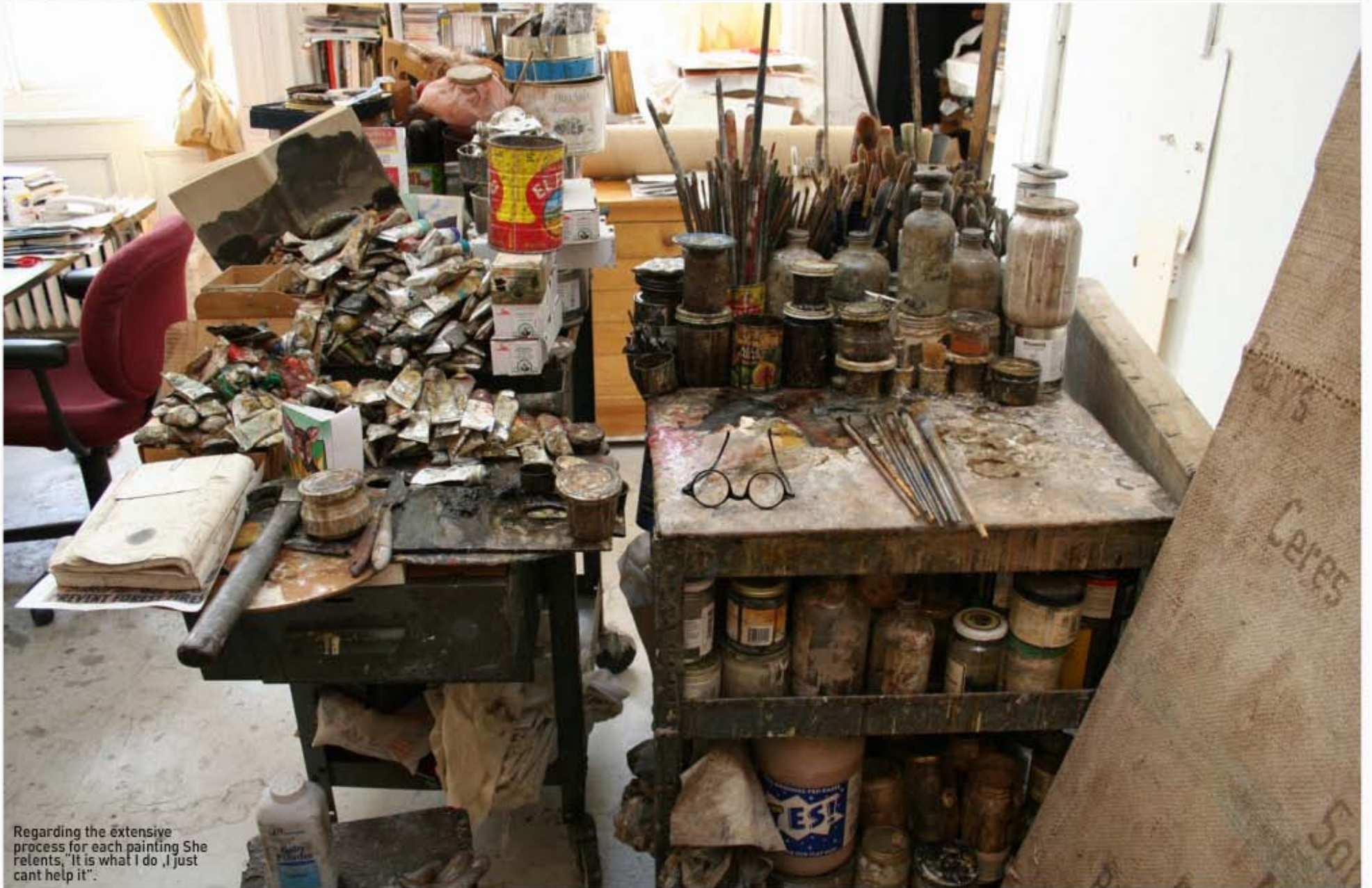
Regarding the extensive process for each painting She relents, "It is what I do ,I just cant help it".