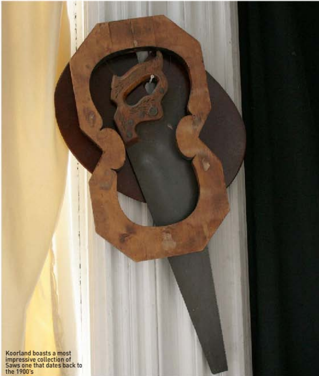
Koorland boasts a most impressive collection of Saws one that dates back to the 1900's